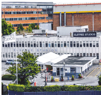
Elstree Film Studios

Founded in 2017, Lifecast Body Simulation has developed a range of highly accurate and lifelike medical manikins which are transforming the way medical simulation and education are delivered and absorbed.